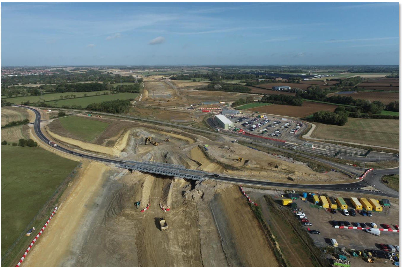
Figure 2: EKFB has achieved a major milestone in T2G, by completing the road and bridge works at the A422 roundabout, which is now open to public traffic.