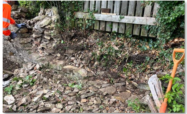
Figure 4: Before

The transformation achieved by our volunteers in repairing and reconstructing the wall is beautifully captured in a series of before and after photographs. These images showcase their outstanding work.