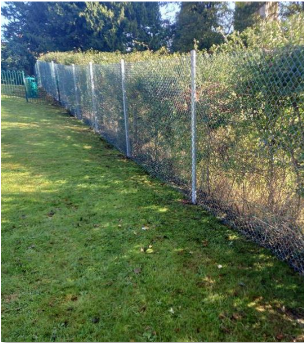
Figure 6: New Fencing at the Brackley Allotment, Egerton Site.