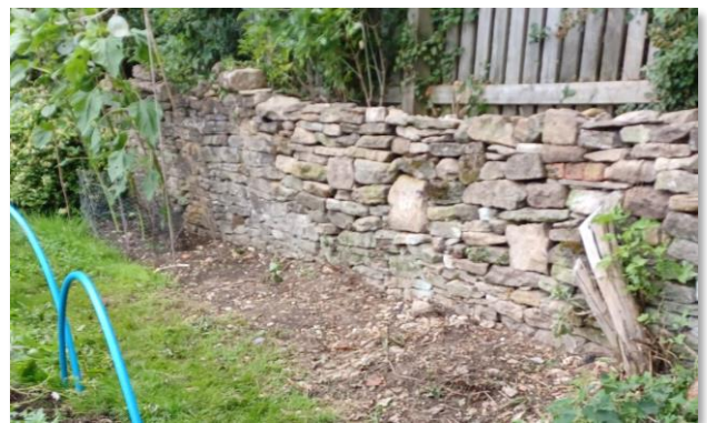
Figure 5: After

“a fantastic job, way beyond our expectations”