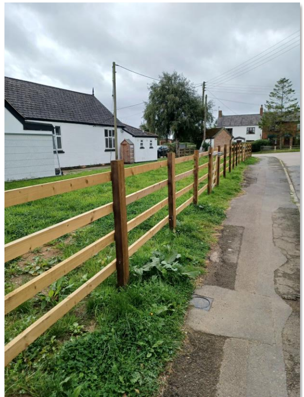
Figure 7: New fencing at Twyford Village Hall installed by our subcontractors HW Martin.

This endeavour is part of a larger initiative led by the parish council to establish a community space and garden, destined to be enjoyed by local residents. We look forward to seeing the parish council's progress as it begins to take shape.