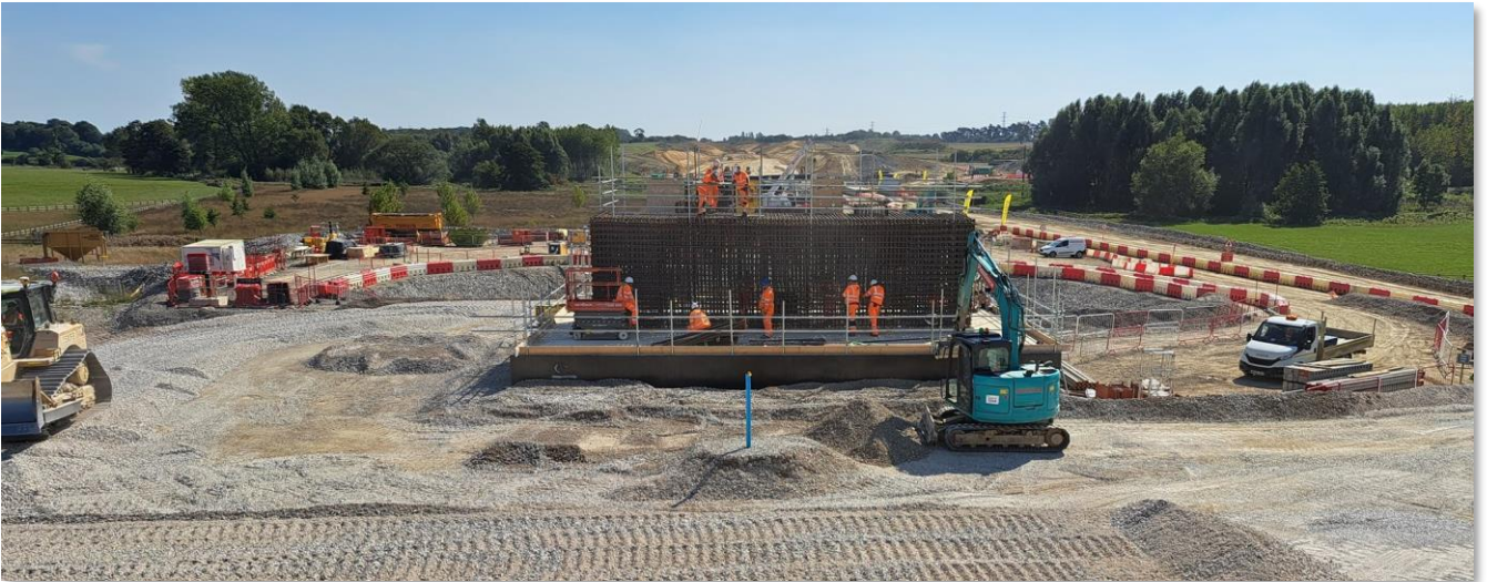
Figure 1: Westbury Viaduct -In September our teams carried out the structural backfilling of material around the pile cap at abutment A8 of Westbury Viaduct.