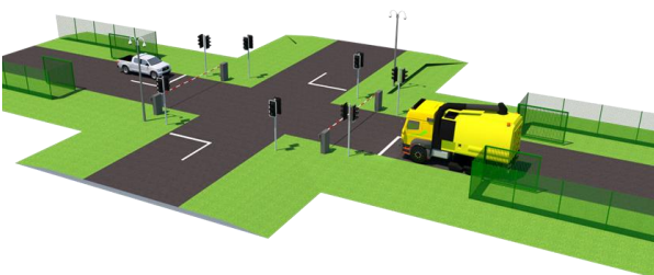
Figure 3: Example of our site access crossing points located where our internal road meets the public highway.

Our teams continue to construct the site access road that runs the length of HS2. This internal road allows our construction traffic to stay within HS2 land, reducing our impact on the local road network. Where our internal access road meets the public highway there are controlled crossing points with temporary traffic lights, manually operated by our teams. We would like to remind the public to adhere to the traffic signals. Safety is paramount and it is important that the signals are followed to avoid any collisions or near misses with our large construction vehicles.