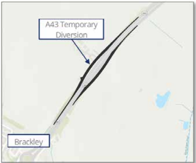
Figure 1: The image above details the location of the temporary diversion that will be constructed this year for a section of the A43 near Brackley.

Throughout the spring of 2023, we have been preparing for the main construction phase of the new temporary diversion.